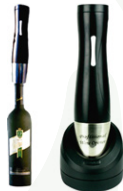
— Rechargeable bottle opener —