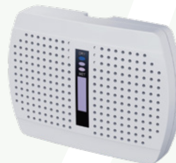
— Renewable rechargeable dehumidifier —