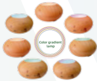
Wood grain model