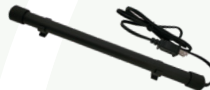
— Dehumidifier Rod —