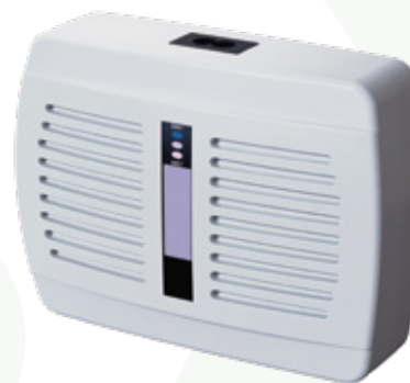
— Renewable rechargeable dehumidifier —