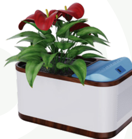
- Pot humidifier -