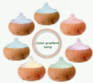
Wood grain model