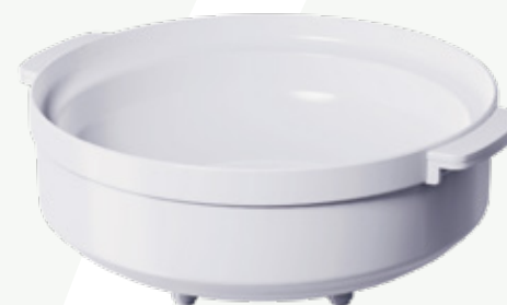
- Pet basin humidifier -