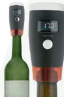
— Intelligent vacuum sealing machine —