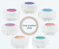
The white model