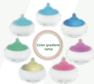
The white model