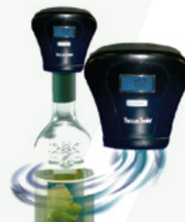
— Intelligent vacuum sealing machine —